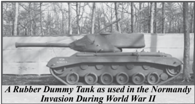
A Rubber Dummy Tank as used in the Normandy Invasion During World War II

During World War II, Master Tire earned a special citation from the armed forces for converting to wartime production of inflatable rafts, pontoon bridges, lifesaving devices and waterproof bags.