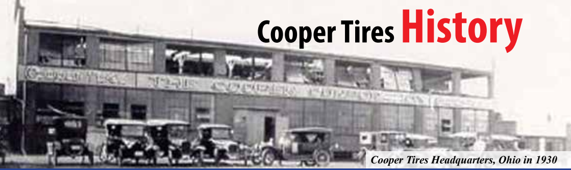
Cooper Tires Headquarters, Ohio in 1930