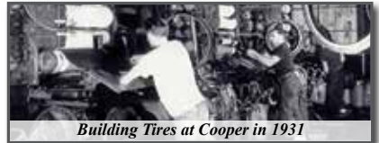
Building Tires at Cooper in 1931

These two companies merged with the Falls Rubber Company of Cuyahoga Falls, Ohio, in 1930 and formed The Master Tire & Rubber Company.