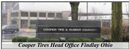
Cooper Tires Head Office Findlay Ohio

Today Cooper stands as one of only two U.S. owned tyre manufactures and is the tenth largest tyre manufacture in the world. From one small manufacturing plant in Findlay to 3 major US tyre factories today.