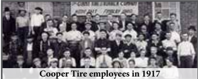
Cooper Tire employees in 1917

Cooper traces its roots back to Akron, Ohio when two brothers-in-law purchased the M & M Company in 1914, making tyre patches and repair kits. The owners then purchased the Giant Tire & Rubber Company to make "rebuilt" tyres and moved the business to Findlay, Ohio in 1917. (Cooper is still located on this original property at the intersection of Lima and Western Avenues).